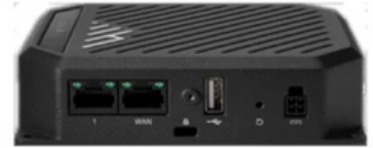
s700 versatile semi- ruggedised IOT router