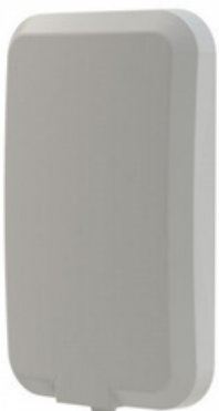
Panorama 4x4 MIMO Directional Panel Antenna